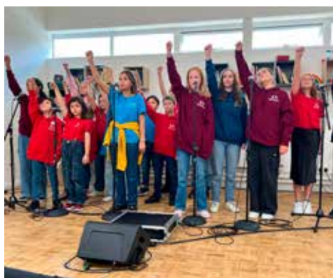
We Are the Voice