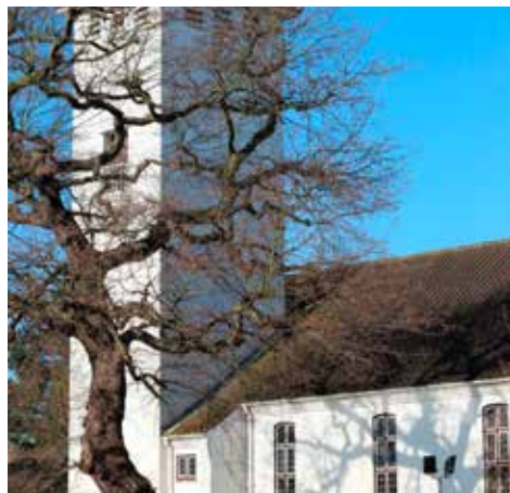
All Saints Weston

Known locally as ‘the white church by the pond’, All Saints Weston, on its current site, has been at the heart of our local community for over 85 years. It has provided a home for weddings, baptisms, funerals, regular church services, toddler groups, plays, film nights, concerts, rehearsals, school outings and so many other occasions that build a community. Through good years and difficult ones, the building’s tall white walls and tower have stood as a symbol of the identity of Weston Green.