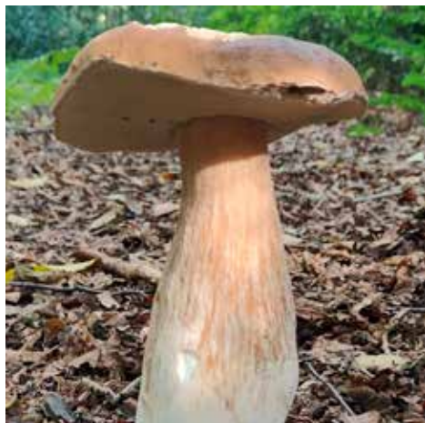
Penny Bun (Boletus edulis)

Boletus mushrooms have pores rather than gills on the underside of their caps and include some of the most prized edible species such as the Penny Bun ( Boletus edulis ) known in France as Cep and in Italy as Porcino . Boletus mushrooms are typically found in woodland environments. Another highly regarded culinary mushroom family are the Cantharellus or 'Chanterelles'. The most famous British member is the Chanterelle ( Cantharellus cibarius ) which has an egg-yolk yellow cap and loose folds rather than gills. Gills are substituted for 'spines' in the Wood Hedgehog ( Hydum repandum ), which has a pale buff-coloured cap and a short, solid stem. This common mushroom is a great one for beginner foragers to learn as the spines make it easy to identify. It is most readily found in Beech woods.