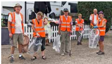
Litter picking every month