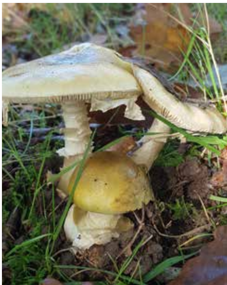
Beware of the Deathcap mushroom!

Facebook: Ben West: Where the wild things are