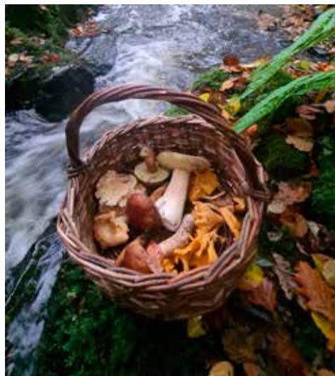
November brings late season mushrooms

Winter is often regarded as a barren period in terms of wildlife interest but there is much to see in the months of November, December, January and February. As temperatures drop off in November, late season mushrooms start to emerge. With over ten thousand species on the British list the world of fungi can be rather daunting for the uninitiated. However, there are a number of commonly occurring species which are fairly easy to recognise once you get your eye in. Perhaps the most iconic of all British mushrooms is the Fly Agaric ( Amanita muscaria ). This is the classic red-capped toadstool with white spots. It can be found locally in Birch woodland. The Amanita family also has a couple of well-known deadly species such as the Destroying Angel ( Amanita virosa ) and the Deathcap ( Amanita phalloides ). All species