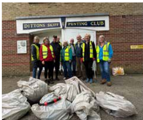
Litter pickers from Dittons Skiff & Punting Club