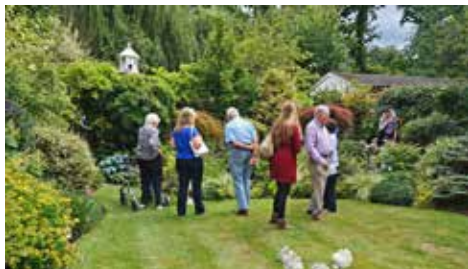
Secret Gardens events