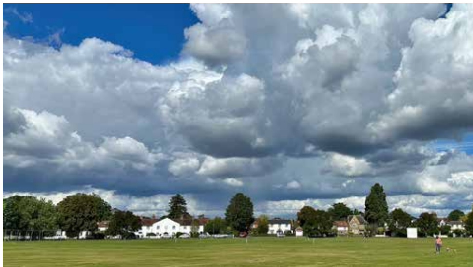
Clouds forming over Giggs Hill Green