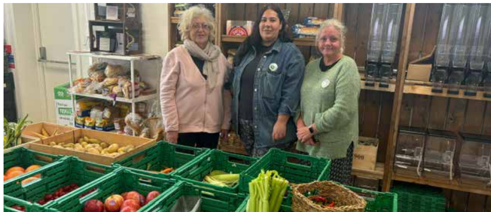
Some of our volunteers at Waste to Plate

The cost-of-living crisis has hit many of us, prompting a much-needed reflection on how we value and use our resources—especially food. It's a shocking truth that 9.5 million tonnes of food are wasted each year in the UK, much of it perfectly edible. This is not just an economic scandal, it is an environmental one too, contributing to the strain on our planet at a time when sustainability has never been more urgent.