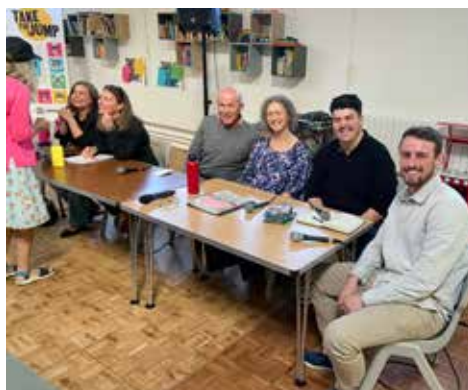
Some of the panellists from 'Just One Green Thing'