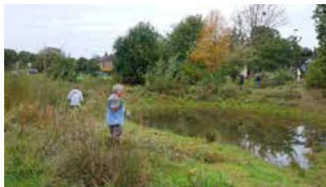
Milbourne pond restoration & maintenance