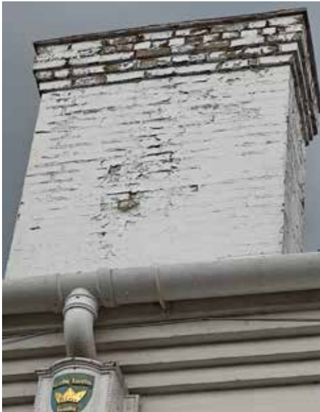
Fabric in need of repair

Please do come along to these if you can and for more information email office@allsaintsweston.com