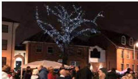
High Street Christmas lights

Some of what the RA and its volunteers do so well